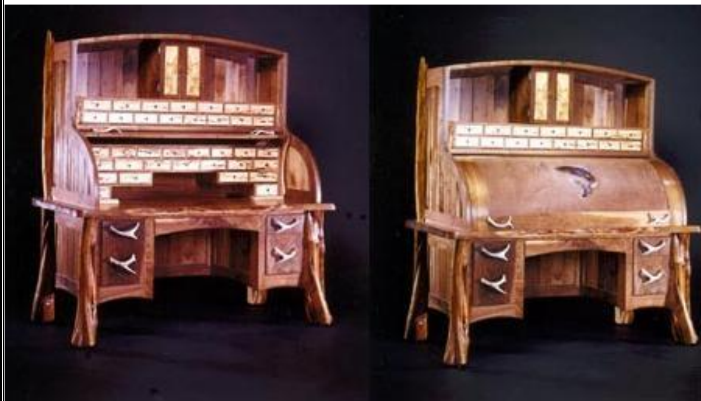
For the OCD Fly Tier

BLUE shirts & BLUE hat @ R200.00 for both Contact Dave Smith