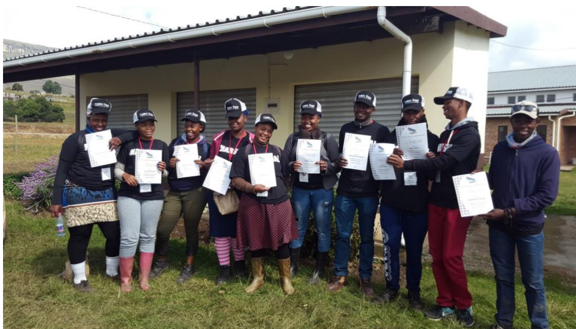
River marshals 2015 SA Flyfishing Champs Tendele