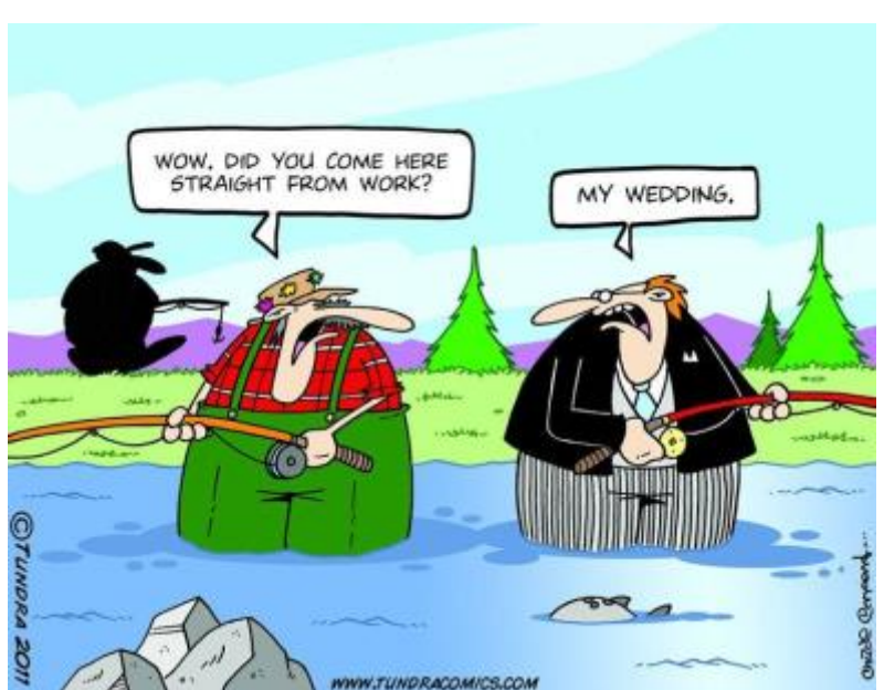
Page 3 of 10