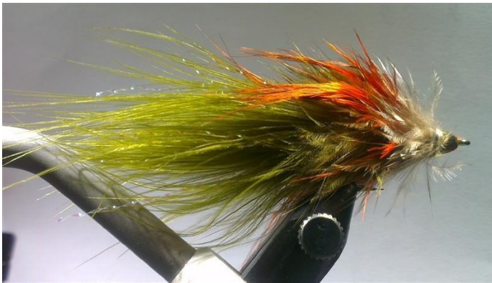
The Sick Puppy