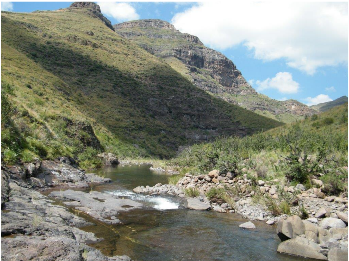
They say a picture speaks a thousand words.