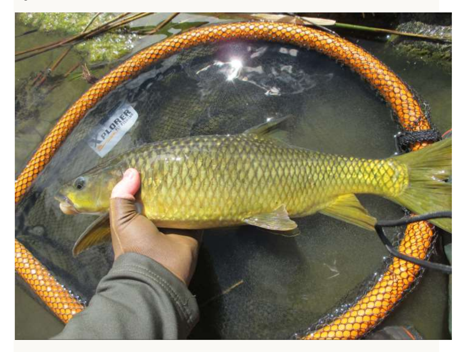
My first Riet River Small Mouth Yellowfish

fish. The fish measured 18" and had given me a good run for my money. No wonder they are popular targets for anglers.