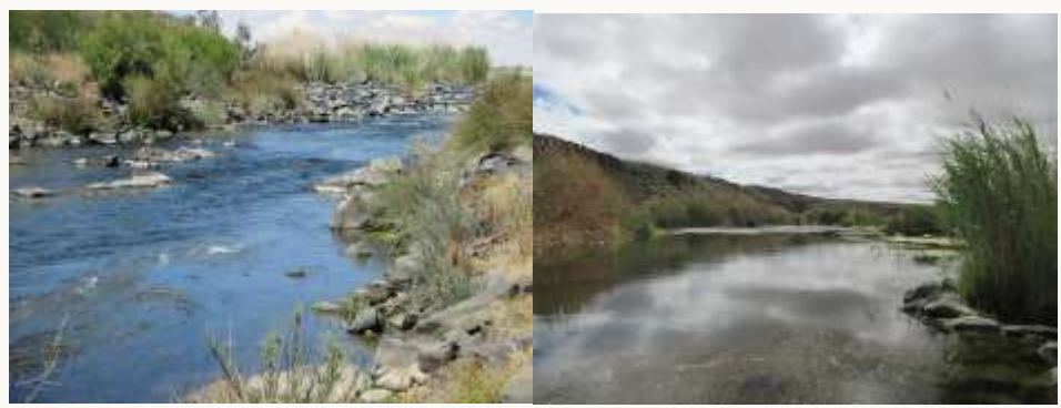
The Riet River