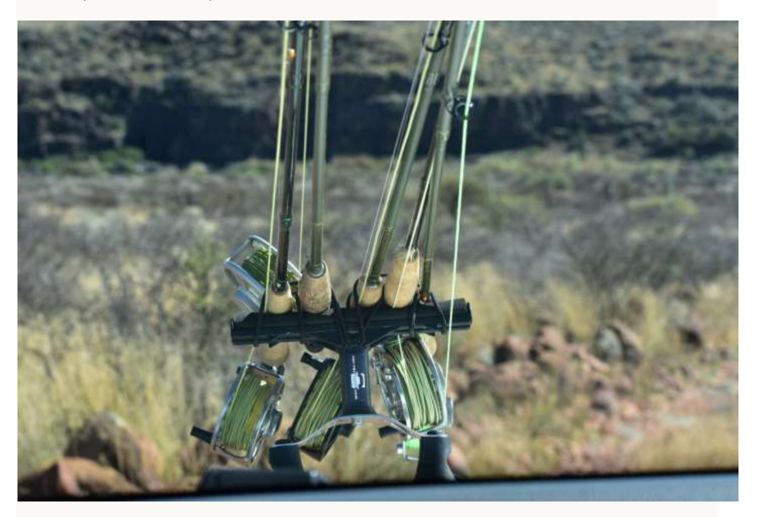
Weapons at the ready

This piece of river has been described as clean and pristine and more importantly teaming with Yellowfish. That would be the Large Mouth Yellowfish (Labeobarbus kimberleyensis), known locally as "Largies", and Small Mouth Yellowfish (Labeobarbus aeneus), also called "Smalies".