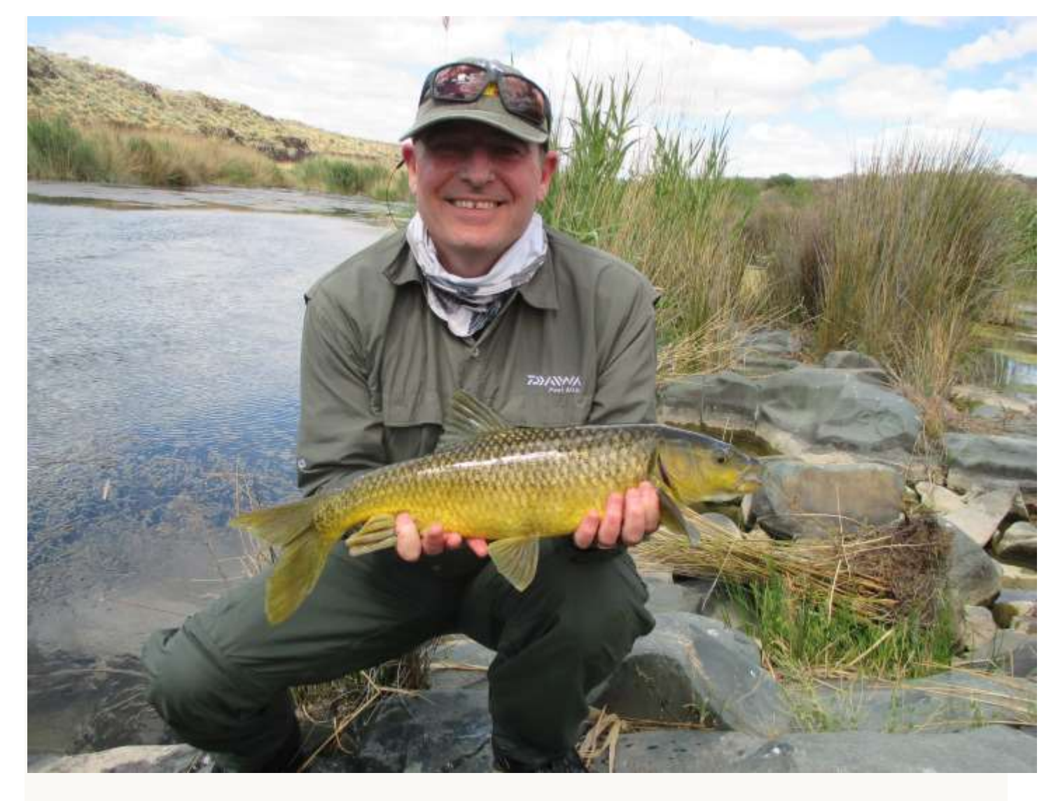
The Author with a beautiful Riet River "Smallie"

One of my drifts did not induce a take so I let line out as the fly headed down to the pool. I had difficulty seeing the fly as the weeds I'd used to hide behind were so thick I had to lean out to see it. At about this time I realised my fly line had looped around the reel so I stopped to sort this out. I then started stripping back line so I could recast. Well something hit my fly...hard!. The fish then decided to turn around and head downstream. The reel started screaming and then the tippet popped. I wonder if it was a "largie" having seen a few cruising the river the day before. I guess I'll never know.