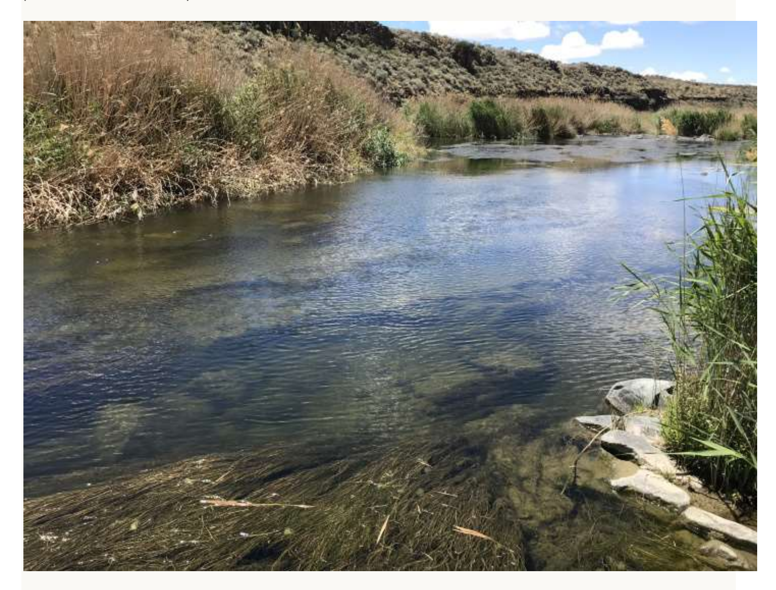
The clean and pristine Riet River

channel that was just opposite the start of a large pool. I waded out to the island and surveyed the river. The same alternating weed and open water channels that I saw the previous day were there. But as these channels got to the pool the river was relatively weed free.