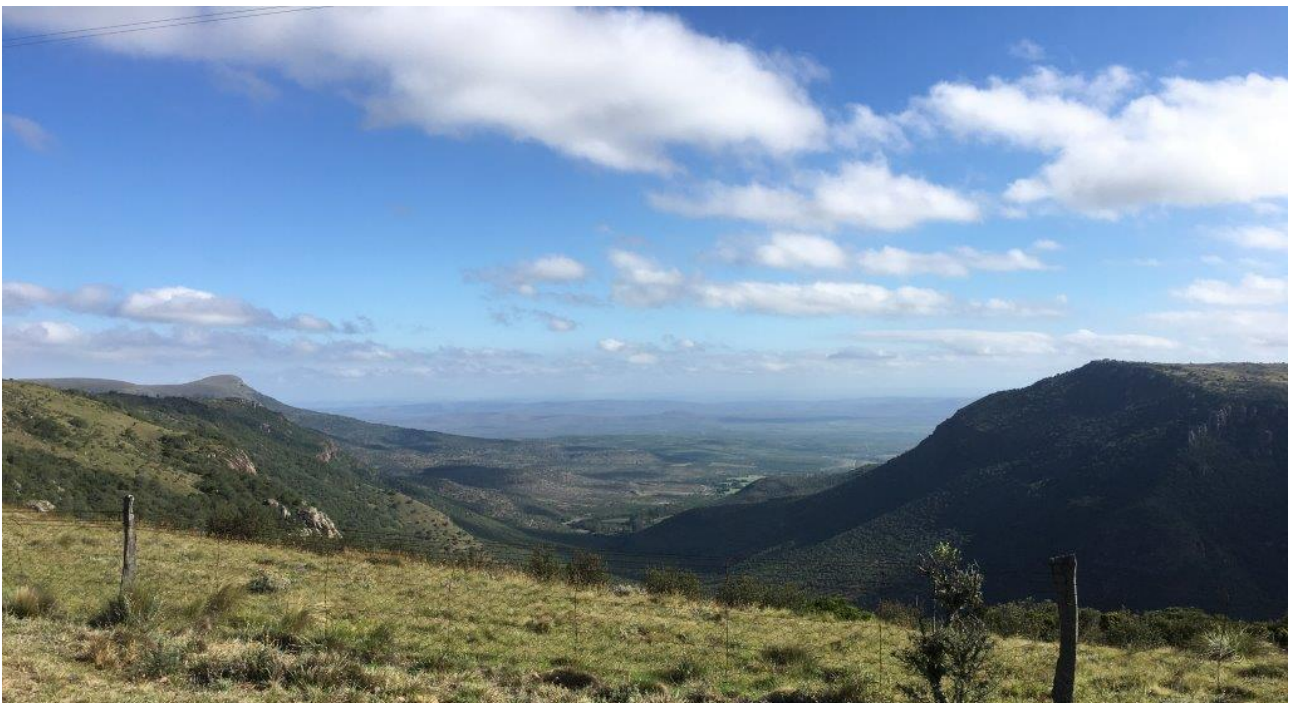
On top of the Banksberg in Somerset East

I don't know if it is just me but fly fishing trips always start over a drink. This one was no exception. Last may saw me enjoying a well lubricated lunch with a bunch of mates at Velorenkloof. Talk, not unnaturally, turned to hogs and where to catch them which of course brought up the Eastern Cape. And so it was that I found myself offering a trip to fish the meanest best big fish still waters in the country. Everyone was in until I asked if they were really in when it turned out that only Russel could make it. Stevie Brooks stepped in and martin Davies offered to arrange the fishing and so away we went at the beginning of January on a 2 500km ten day expedition through some of the best stillwater fishing the Eastern Cape has to offer.