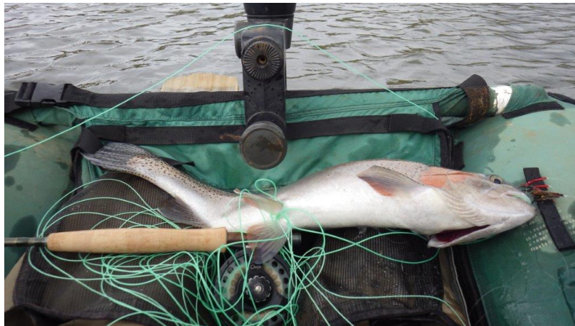
My 70cm string bean caught at Ventnor

I got it half right. The weather was relatively cool for most of the trip which meant the warmest trout water we had to contend with was 21C. However it hardly rained. The drought was really bad. The fishing was surprisingly good considering both the time of the year and the lack of water.