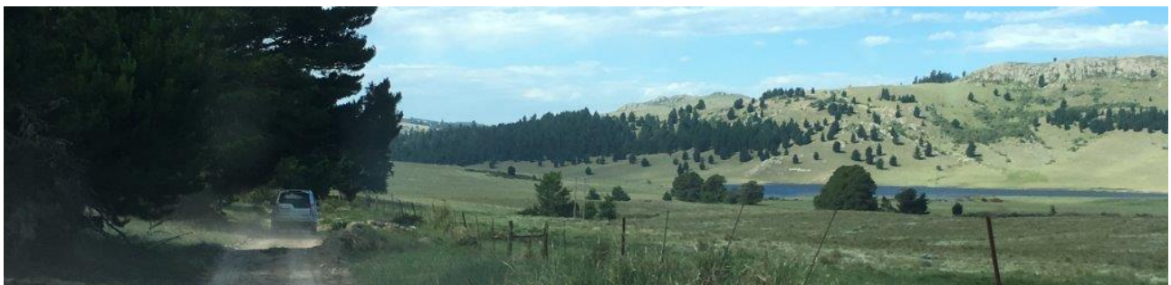
Loch Lochy in the Hogsback