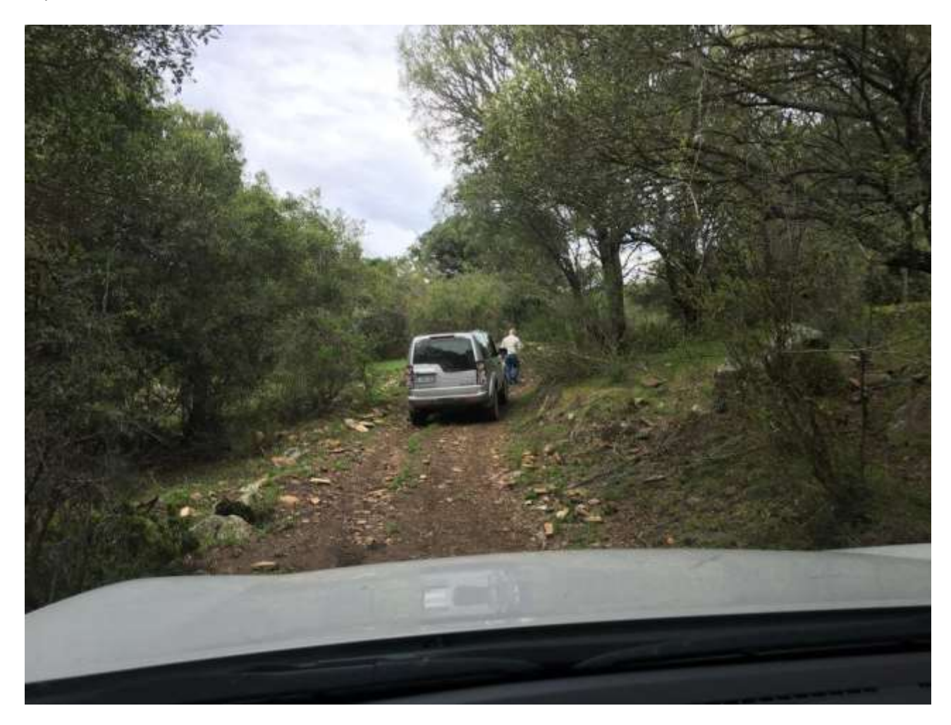
Road travel goes back a century or two. Guiding a Landover over rough terrain

town garages don't generally stock the kind of tyre you put on a luxury SUV and they are bloody expensive.